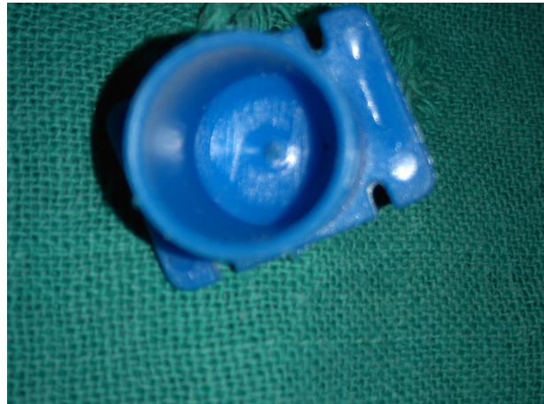
Figure 1,2. The connector of tubes are completely occluded